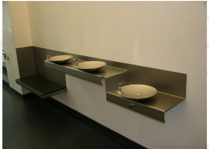
Granex - Washroom Vanity Top