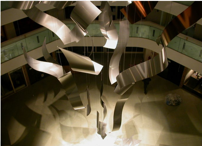
Cobalt - Public Art Sculpture

With a number of surface finishes available, the Bare Essentials range will capture your imagination when looking for a surface treatment that offers a true metallic lustre which can only be achieved with the use of a real metal laminate.