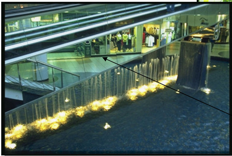
Escalator clad on sides and underneath with Super Mirror panelling